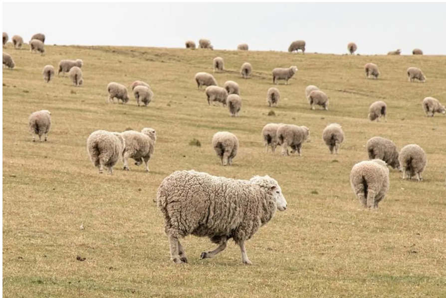
Obasan sources organic wool from Corriedale sheep in Patagonia.