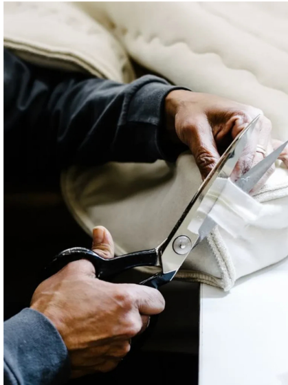
Each product is handmade in the Ottawa workshop.

To provide support and structure, Obasan incorporates organic rubber from Sri Lanka. Harvested from the Hevea brasiliensis tree, the rubber is processed without chemicals, maintaining its natural elasticity and resilience. This material not only offers superior pressure relief and spinal alignment but is also antimicrobial and dust-mite resistant, ensuring a cleaner, healthier sleep surface. Finally, the customizable wooden legs, the foundations of Obasan's mattresses, are crafted from FSC-certified wood, a mix of spruce and poplar, sourced from responsibly managed forests in Quebec. Free from chemical treatments and assembled without glue, reflecting the brand's commitment to creating products that are as kind to the planet as they are to the body.