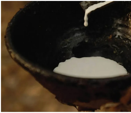
Obasan harvests organic rubber from the Hevea brasiliensis tree in Sri Lanka.