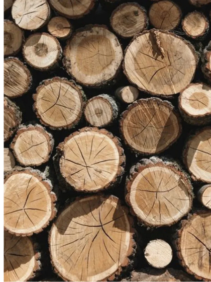
FSC-certified wood, a mix of spruce and poplar, is sourced from responsibly managed forests in Quebec.