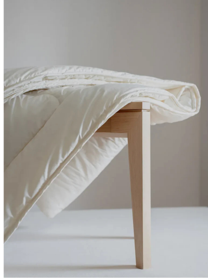
Lightweight Comforter.

For Obasan, sleep is more than rest, it's restoration, health and connection with our bodies. Its products are designed not just to improve sleep but to enhance overall wellbeing. It's about creating a sleep environment that feels good, inside and out, where every choice reflects a commitment to living well. When it comes to considering how we sleep, Obasan stands as a testament to how thoughtful craftsmanship, ethical materials and mindful design can truly transform the way we sleep. Because when sleep is healthy, life is better and with Obasan, that transformation begins the moment you close your eyes.