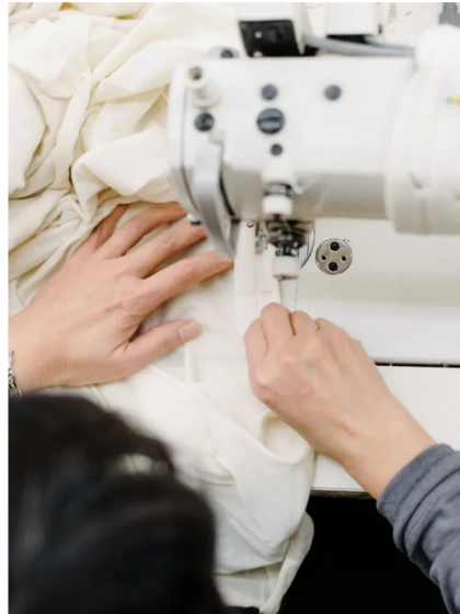
Skilled artisans make each product by hand in the Ottawa workshop.