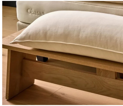
Obasan range of products.