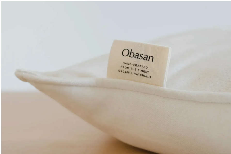
Latex Rubber Pillow.

Discover Obasan products at the WLLW Shop .