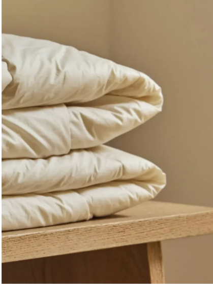
Comforters by Obasan.