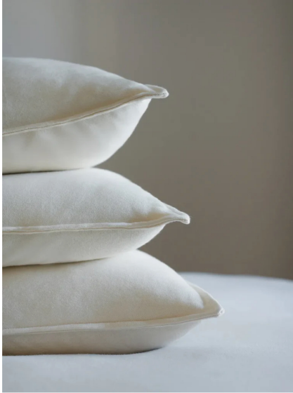
Latex Rubber Pillows.