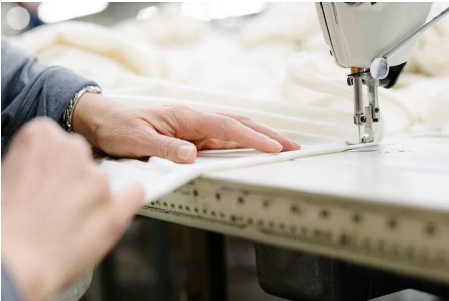
Obasan products are handmade in Canada.